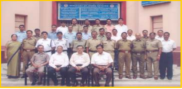
Course on "Crime Scene Investigation" at CDTS, Kolkata