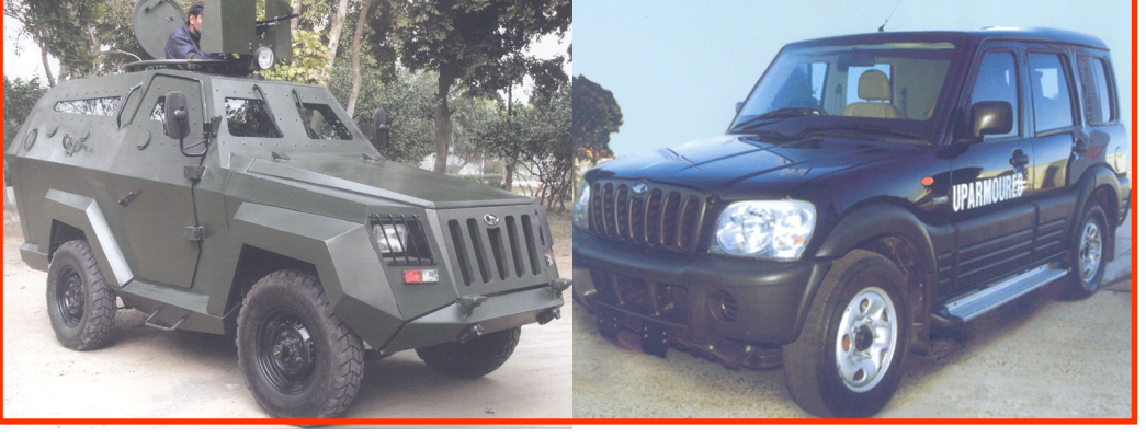
The Marksman and UP-armoured Scorpio vehicles from Mahindra Defence Systems

vehicles and mine protected proof vehicles during the months of July August, 2009. The firms---VECTRA Armoured Vehicles, Ashok Leyland Vehicles and Mahindra Defence Vehicles--- demonstrated their products and held interactive sessions with the representatives from SPG, BSF NSG, ITBP and MHA to ascertain the capability of the BP Vehicles.