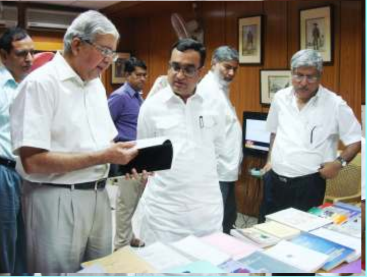
The Minister having a look at the BPR&D' Publications and research works